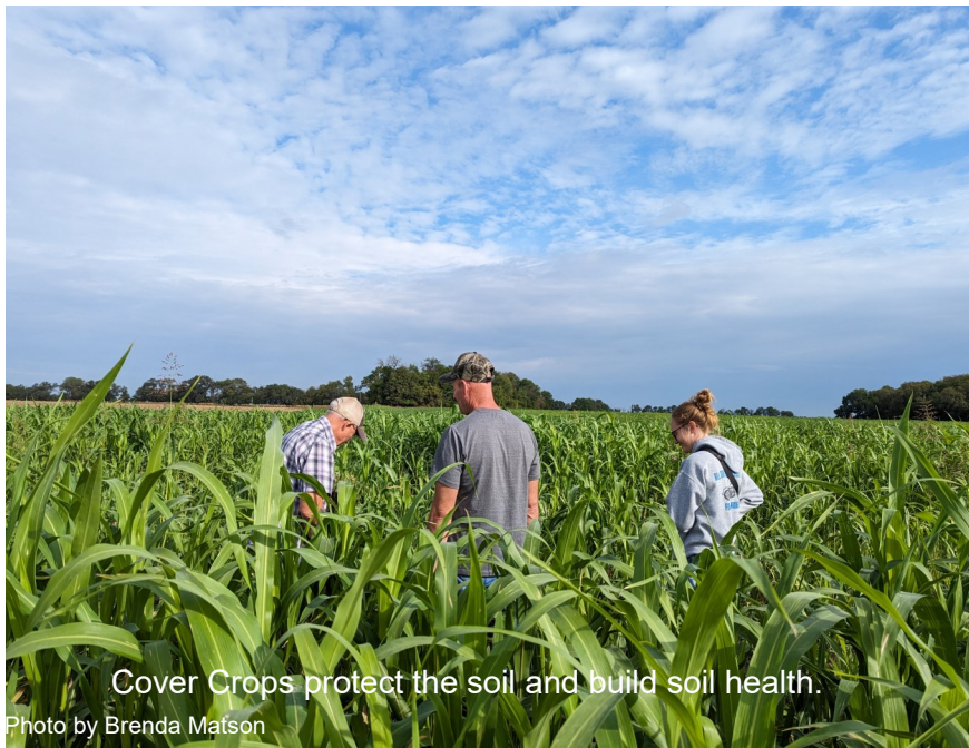
Cover Crops protect the soil and build soil health.