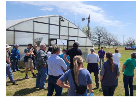
Specialty Crop & Urban Ag Event