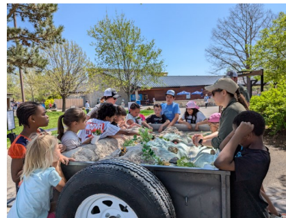
Demonstrating streambank erosion at the Sedgwick County Zoo