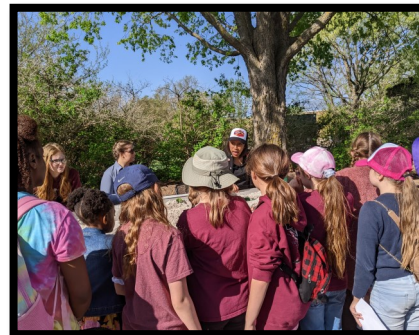
Demonstrating streambank erosion at the Sedgwick County Zoo