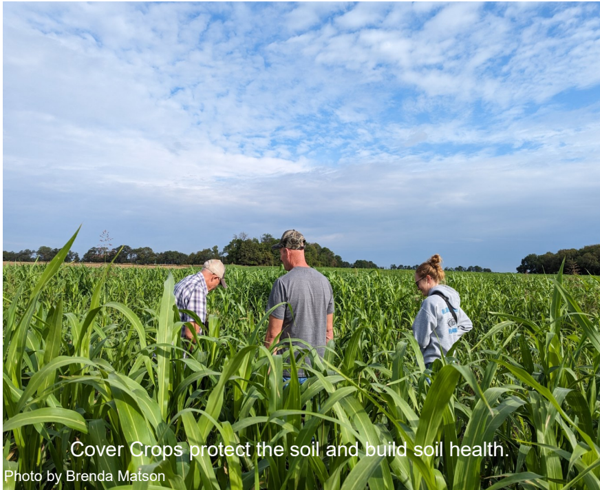
Cover Crops protect the soil and build soil health.