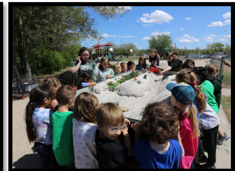
Environmental education at Earhart Environmental Magnet