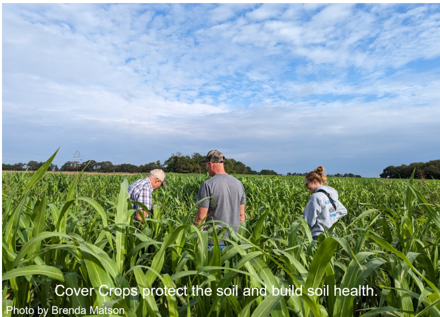
Cover Crops protect the soil and build soil health.