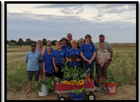
Soil Health education at Clearwater Milpa Planting