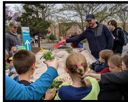
Demonstrating streambank erosion at the Sedgwick County Zoo