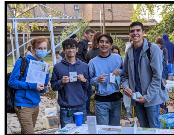
Friends University Early College Academy students are ready to plant pollinator and milpa seeds.

The Natural Resources Conservation Service (NRCS) continues to assist the Conservation District in designing practices that are built through the Water Resources Program. Onsite waste systems are the exception to the requirement for NRCS built "Standards and Specifications." Metropolitan Area Building & Construction Department (MABCD) permits and inspects onsite waste systems in Sedgwick County.