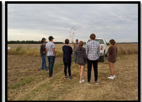
Soil Health education at Clearwater Milpa Planting