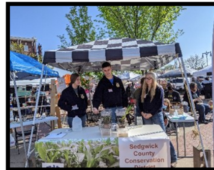
Demonstrating the effect of rainfall on different farming practices at Soil Stories event