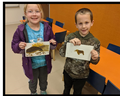
students experiment with soil painting at Mulvane Public Library after school program