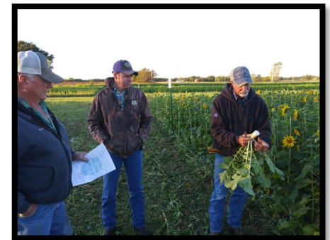
Cover Crop Come & See Event